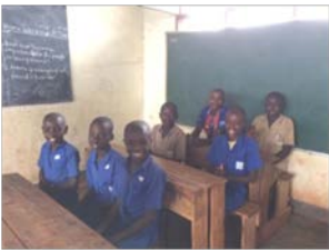
happy to be in class

The children are so excited to receive love, prayers, and gifts from the other side of the world. They believe there are angels in Chicago.