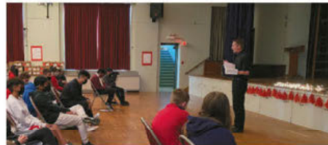
Students in the Confirmation Prep classes participate in Holy Fire.