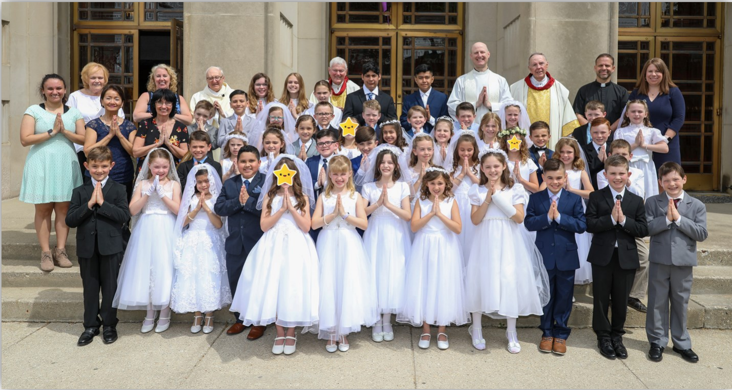
St. Elizabeth of the Trinity First Holy Communion - May 15, 2022