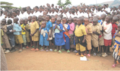
When we started

With all my heart, I thank you. The children, staff and I are praying for you.