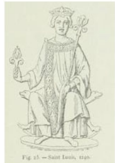
Fig. 25. — Saint Louis, 1246.