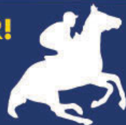
TABLE OF 10 FOR $250 OR $25/PERSON ($30 AT THE DOOR)