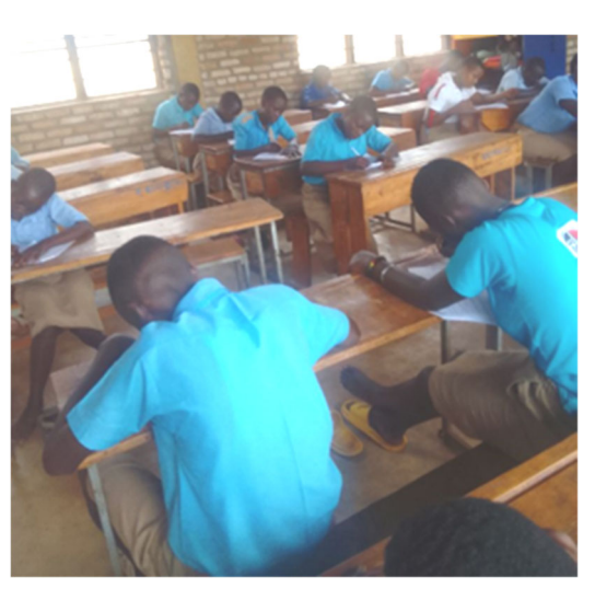
Busy students taking national exams.