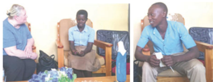
Students discuss (in English) the blessings & love felt from the Sharing Families' generosity