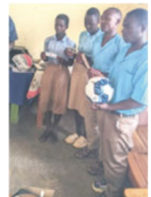
Students excited to receive hand carried gifts for the school