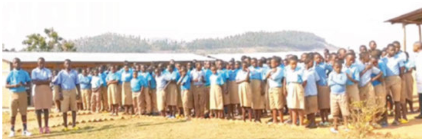
Students preparing for morning prayers

Thank you for your continued support, your gifts will never be forgotten.