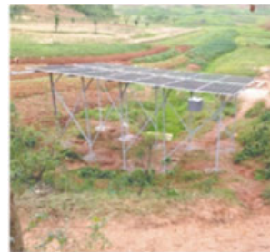
Pump with solar power activation