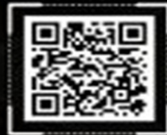
TABLE OF 10 - $250