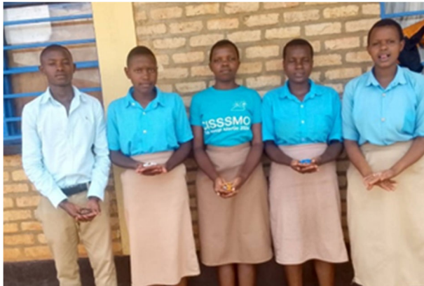
students praying with our rosaries